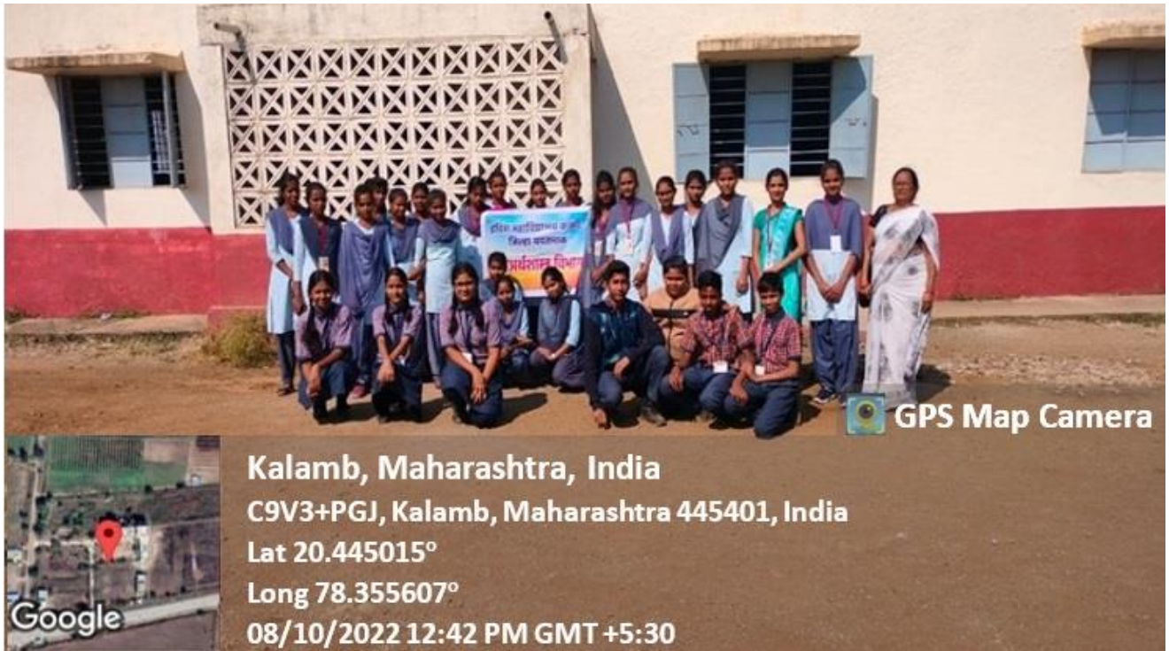
Field Visit to Crayon's English Medium School